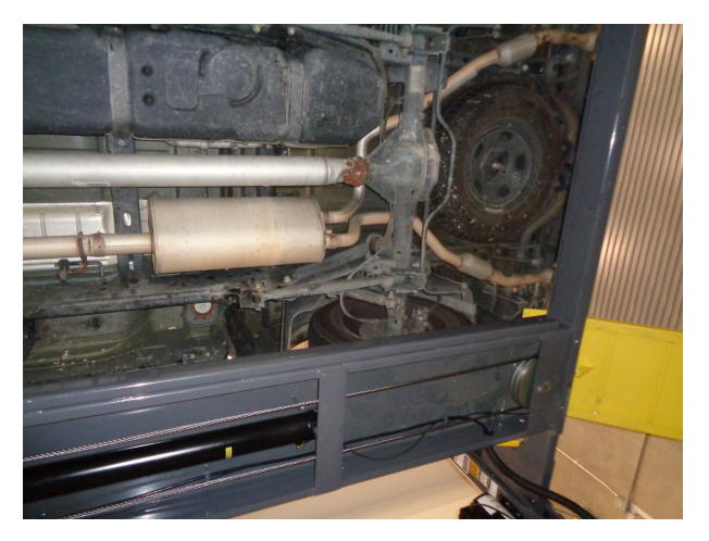
Step 1. Begin removal of the OE muffler by loosening the three clamps attaching the muffler to OE system. Disengage the hangers from the rubber insulators and remove the muffler. Do not discard or damage the rubber insulators as they will be used to install the new system.