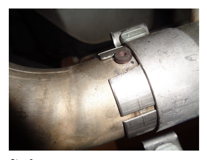
Step 2: To install the MagnaFlow Y-Pipe Assembly slide the inlet onto the OE outlet making sure to align the slot with the peg on the outlet pipe. Secure with the supplied 3.00" clamp.