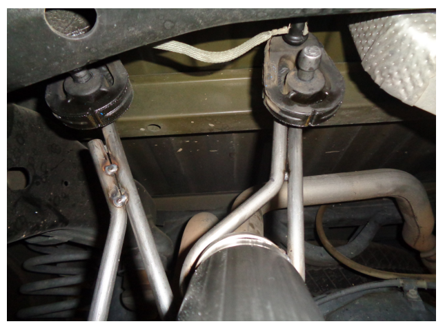
Step 3: insert the welded hangers into the rubber insulators