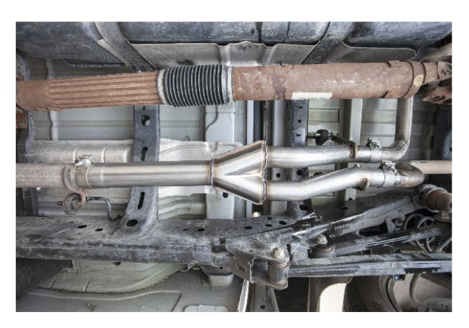
Step 4: Finish by fitting the OE tailpipes into the Y-Pipe Assembly by indexing the alignment pegs and securing with the supplied 2.25" clamps. Once a final position has been chosen for the new exhaust component, evenly tighten all clamps from front to rear using the torque specifications on page one of these instructions. Inspect all fasteners after 25-50 miles for operation and re-tighten if necessary.

MAGNAFLOW: 1901 Corporate Centre Dr - Oceanside, CA 92056 | 1(800)990-0905 Technical Support: 1(800) 959-9226 | Email: moreinfo@magnaflow.com